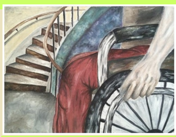
More student creative work here Out of Our Heads http://www.outofourheads.net/